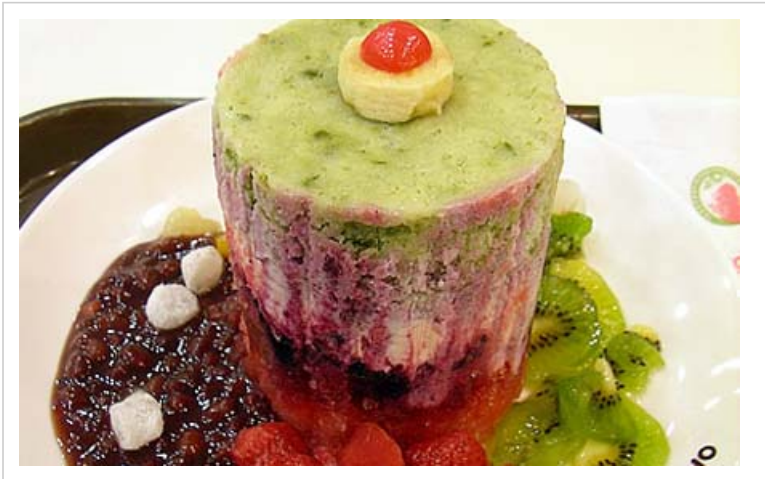
Photo: Tower Bingsu from Iceberry

1211 Potomac Avenue: Philly Pizza & Grill, not to be confused with the Philadelphia Cheesesteak Factory on M Street, will open later this summer next to Georgetown Cupcake. The restaurant will have a small amount of seating on the first floor and additional seating upstairs. The menu has not been completed yet but they hope to serve pizzas, sandwiches, light fare and some breakfast dishes. If the ownership is smart, they will start serving samples to the droves of customers waiting in line for cupcakes next door.